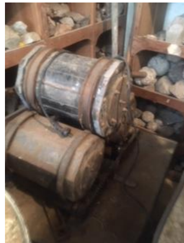
3 – 15lb tumbler & barrels