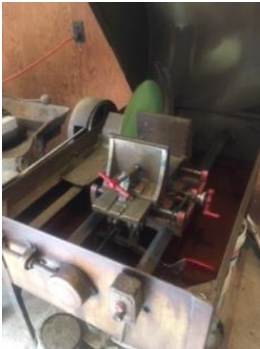
Highland Park 18” saw