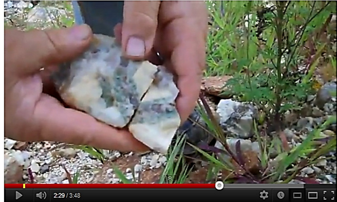
Click the Address Below http://youtu.be/yoiznbVGHC8