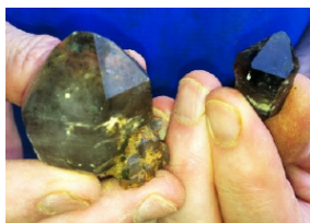
FOUND AT THE REEL MINE

On November 4, 2013, several Club members attended the County Commissioners meeting in Lincoln County to discuss the proposal of the Reel Mine by the landowner to allow mineral digs. MAGMA was also there to object to the idea. We, as members of CVGMC, voiced our approval of the proposal. WE WON. The commissioners overwhelmingly approved the proposal to allow clubs and organizations to dig as long as they provide proof of insurance. I will be hearing back from the landowner as to when we can plan our next dig there. HOORAY FOR THE HOME TEAM!!!