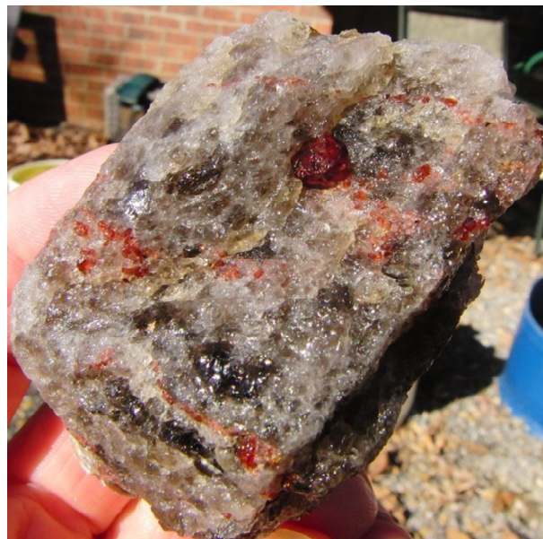
FOUND LAST YEAR AT THE SINK HOLE MINE

Any questions call me at 828-244-6651 or email at pollysrock@yahoo.com .