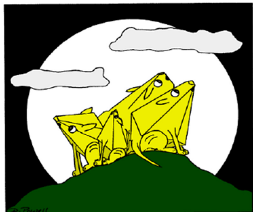
Late at night, if you listen carefully, you can hear the Dogtooth Calcite howling at the moon.

And if you believe this, all I have to say to you is . .