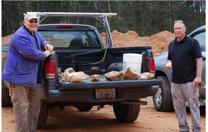
Diamond Hill Mine