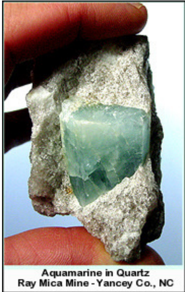
Aquamarine in Quartz Ray Mica Mine - Yancey Co., NC

The field trip for June is scheduled for June 22nd. This is one week later than usual but I am committed prior to this. We will go to the Ray mine in Burnsville. We will meet at my house at 8:00 am. (See directions to the picnic). You will need digging tools, crack hammer, chisels, food, water, raingear. This will be a very strenuous 1/2 mile walk uphill. Anyone wishing to come later may call for directions.