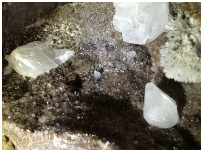
Calcite and Strontianite

The purpose of the Club is to increase the individual's knowledge of the earth sciences and to aid in the development of lapidary and related arts and skills; to promote fellowship and exchange of ideas; to hold exhibitions, contests, lectures and demonstrations for educational purposes; to help interest more people in the gem and mineral hobby; and to capture and preserve the beauty of nature, the arts, and the works of man.