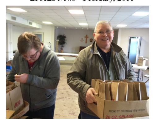
EFMLS News -- February, 2016

Finally, let the junior rockhounds be part of the process. Help them to make contact and learn how to speak with curators. Curators rarely say 'no' to junior rockhounds and using the experience to teach them organizing and communication skills will prove useful for life, not to mention the jobs as future club officers!