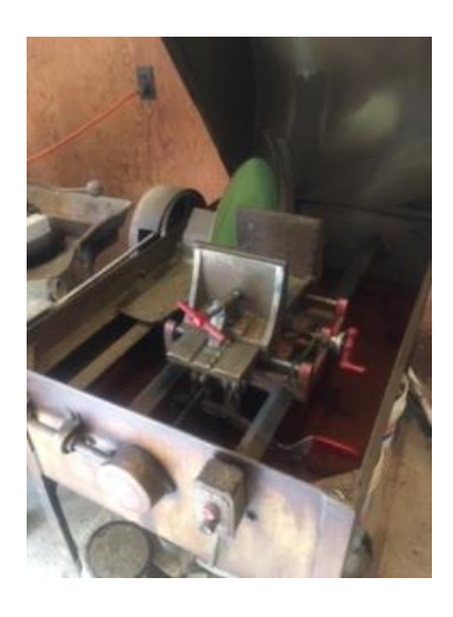
Highland Park 18" saw