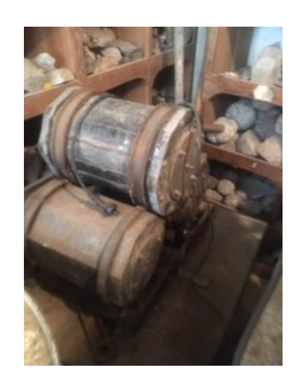
3 - 15lb tumbler & barrels