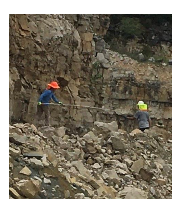
Slade handing Ken one of the clusters across the Berm