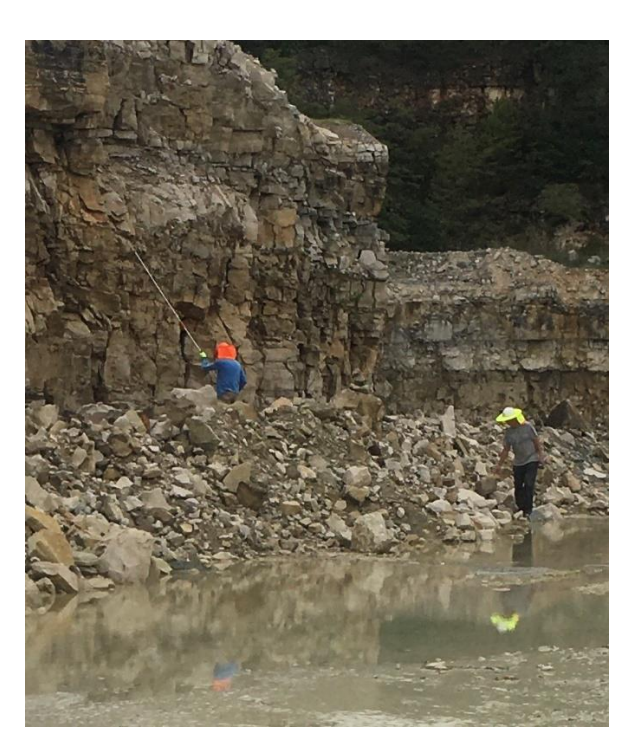
Slade reaching the vug in the rock wall with a 10' Reach stick