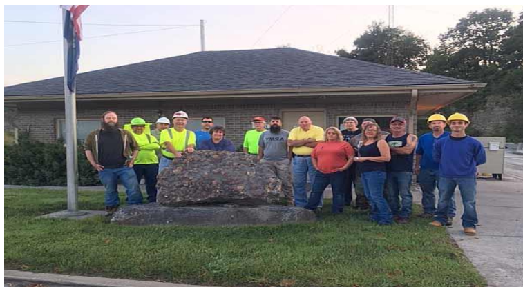
2021 LABOR DAY FIELD TRIP

The purpose of the Club is to increase the individual’s knowledge of the earth sciences and to aid in the development of lapidary and related arts and skills; to promote fellowship and exchange of ideas; to hold exhibitions, contests, lectures and demonstrations for educational purposes; to help interest more people in the gem and mineral hobby; and to capture and preserve the beauty of nature, the arts, and the works of man.