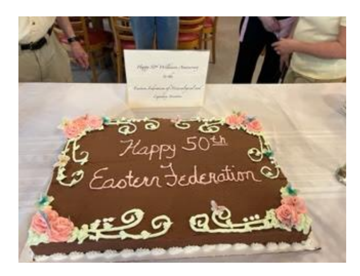
This year was the 50<sup>th</sup> Anniversary for