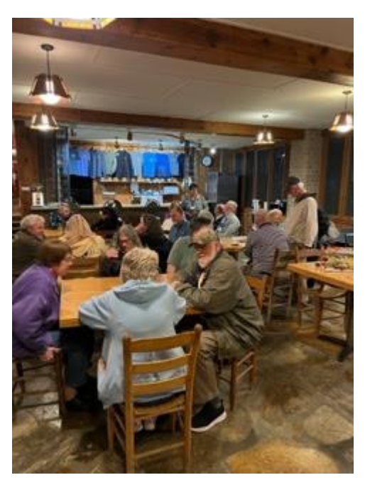
Social Hour in Canteen